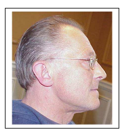
10 months of Maxillary and Mandibular Orthodontics followed by Maxillary fixed-prosthetics maxillary bridge